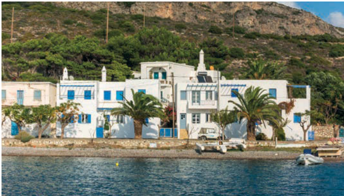
Kyriaki's House is third from the right with grey shutters

The House: Studios for 2 Self Catering Air Conditioning Free WiFi