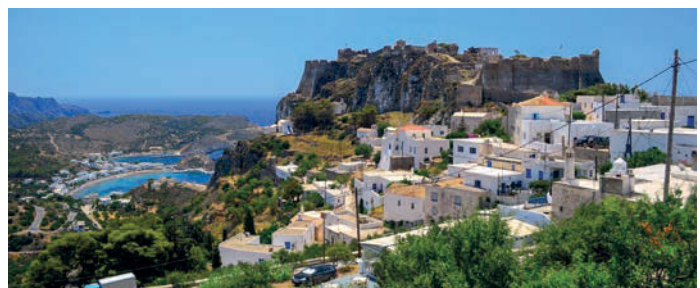
View over Kapsali from Hora

The Guesthouse: Bed & Breakfast Air Conditioning Free WiFi